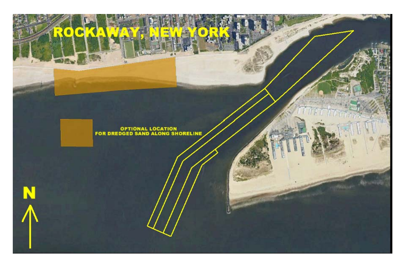
Image 3: Optional East Rockaway Inlet placement location along Rockaway Beach, NY (Google Earth Image Date: June 2017)