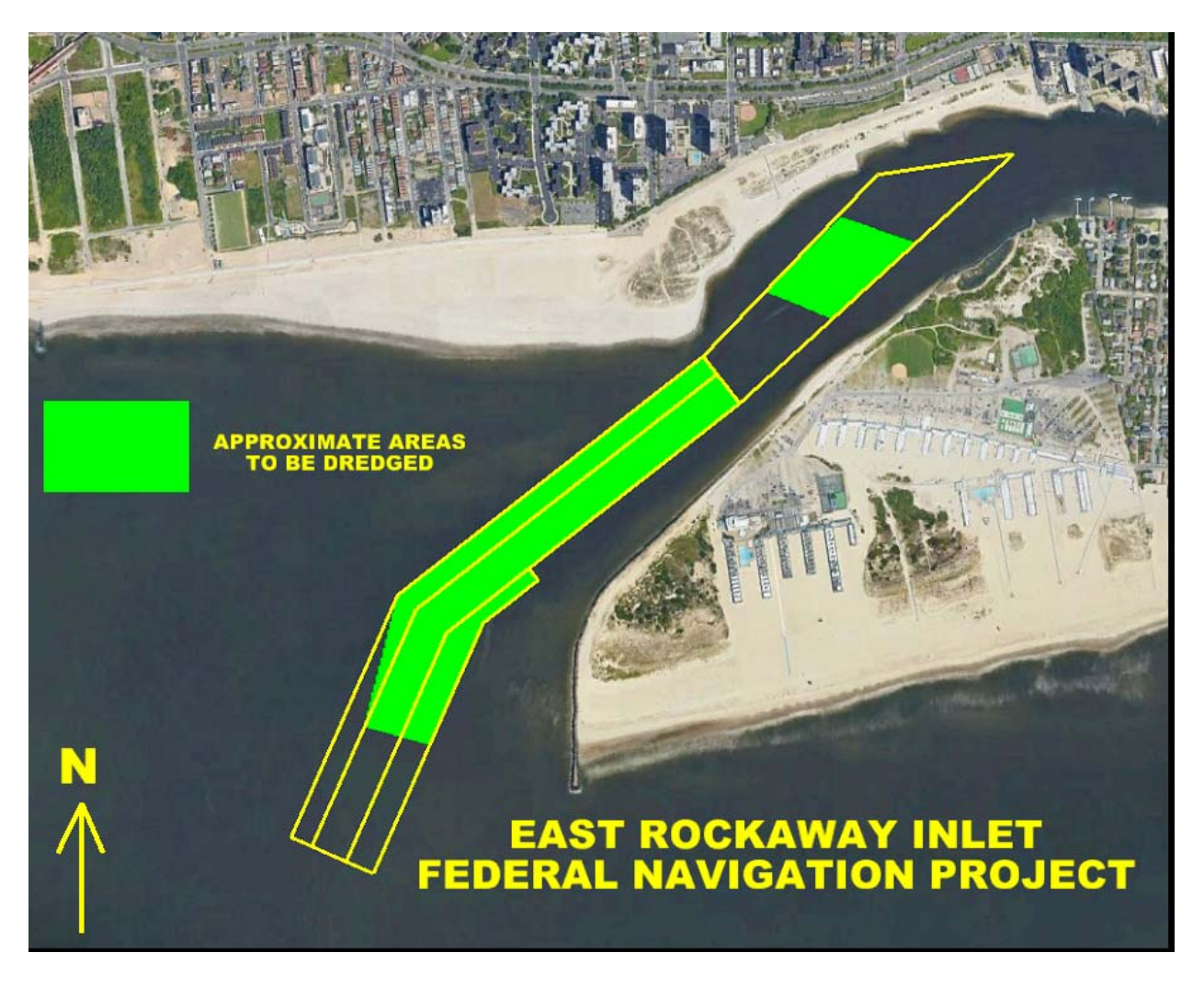
Image 1: East Rockaway Inlet, approximate locations of dredging areas shown (Google Earth Image Date: June 2017)